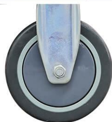
PVC 5" x1.25 fixed castor