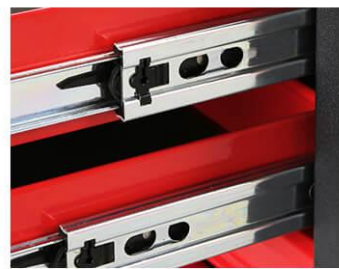
Ball bearing drawer slider