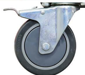
PVC 5" x1.25 swiveled castor