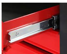
Curve drawer hand