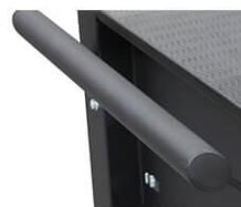
Tubal side handle