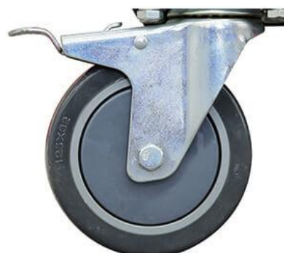
PVC 5" x1.25 swiveled castor