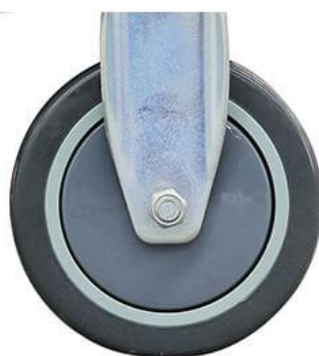
PVC 5" x1.25 fixed castor