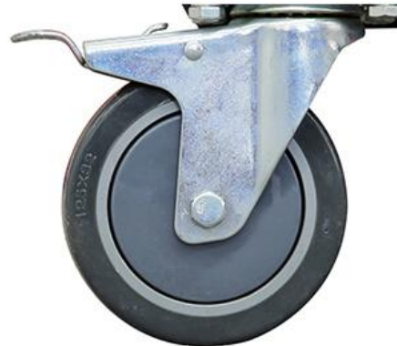
PVC 5" x1.25 swiveled castor