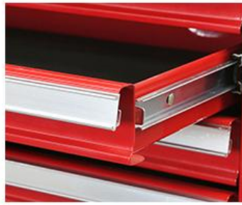
Rolled drawer edges