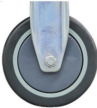
PVC 5" x1.25 fixed castor