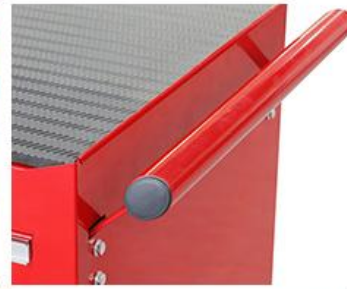
Tubal side handle