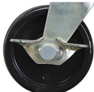
Swiveled castors with brake